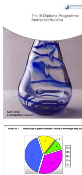
Figure 4. Percentage of grades awarded: theory of knowledge May 2012